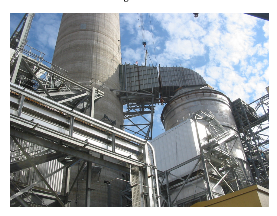
June 1, 2007

Prepared by NESCAUM for the Mid-Atlantic/Northeast Visibility Union (MANE-VU) Regional Planning Organization